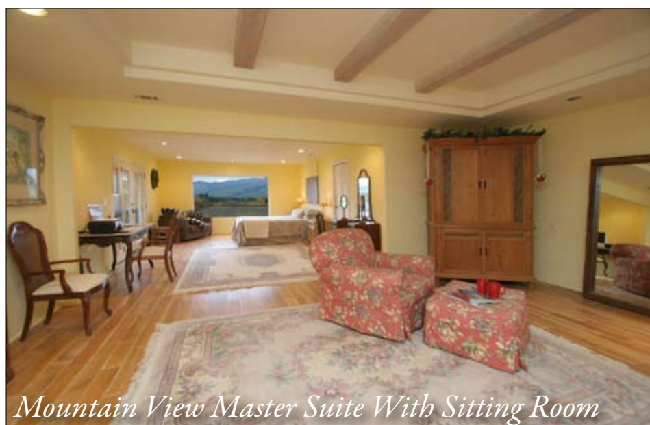
Mountain View Master Suite With Sitting Room