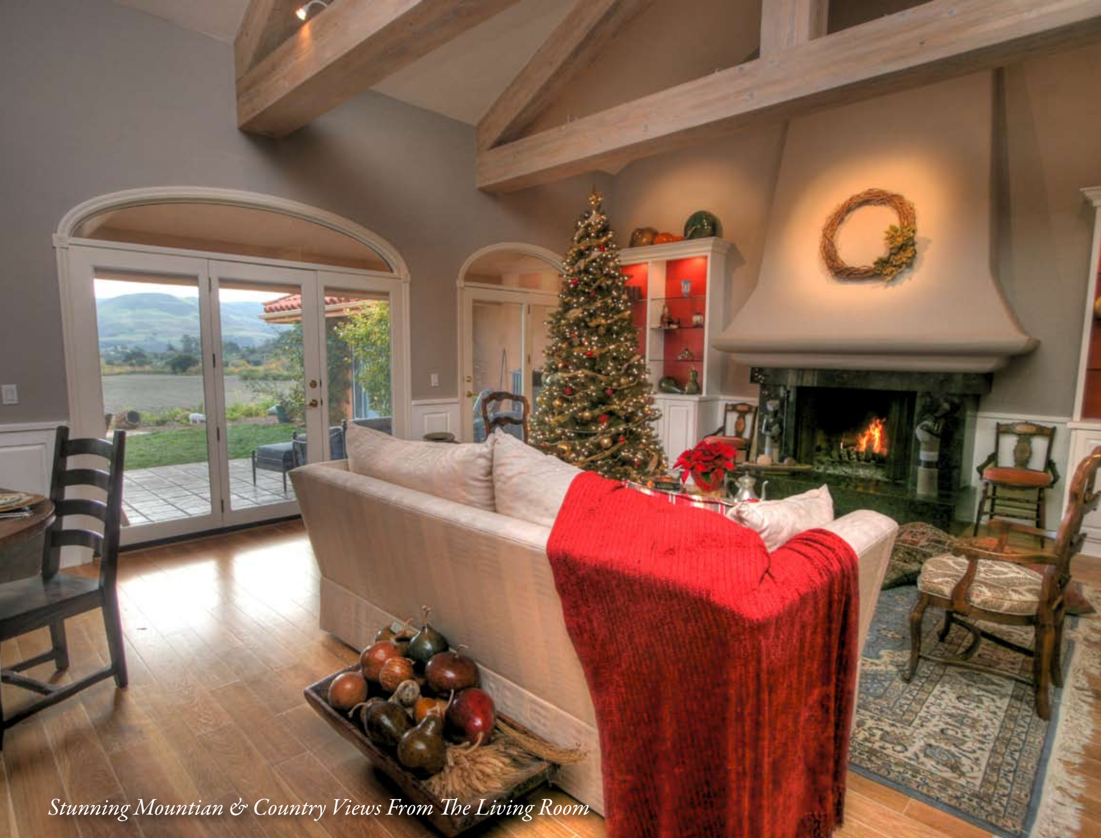
Stunning Mountain & Country Views From The Living Room