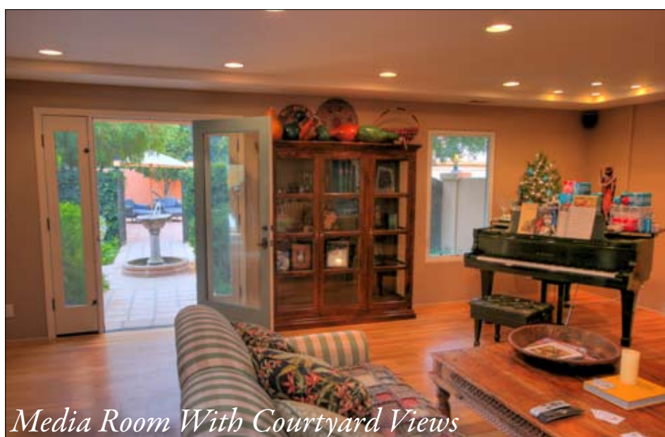
Media Room With Courtyard Views

Tremendous potential for private Santa Rita Hills AVA vineyard or horse property. Close proximity to Ampelos, Seasmoke, Dierberg, Foley, Pierre Lafond, Casa Cassera, Melville and Babcock wine producers. Access to Santa Rosa Creek, with wildlife protected habitat on property, seasonal lake, perfect place for a picnic or nature walk. 4020 Square foot main house, 1007 Square foot guest house, 480 Square foot Artist studio above barn with six windows overlooking surrounding vineyards and hills. 1056 Square foot Rancher's house at far end of property, with beautifully landscaped lawn, mature oak trees and apple orchard. Substantial yearly income from various sources on Ranch, call for a detailed account. Central air conditioning and heat in main house, three wells on property, 30+ acres flat, farmland.