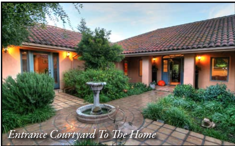
Entrance Courtyard To The Home