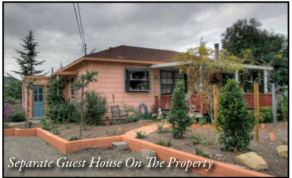
Separate Guest House On The Property