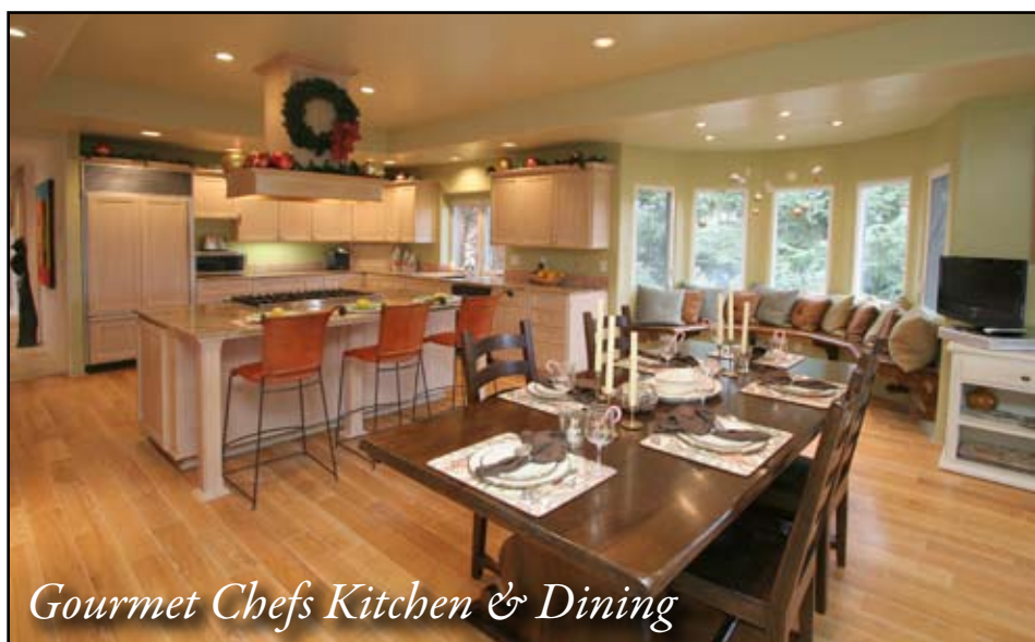
Gourmet Chefs Kitchen & Dining