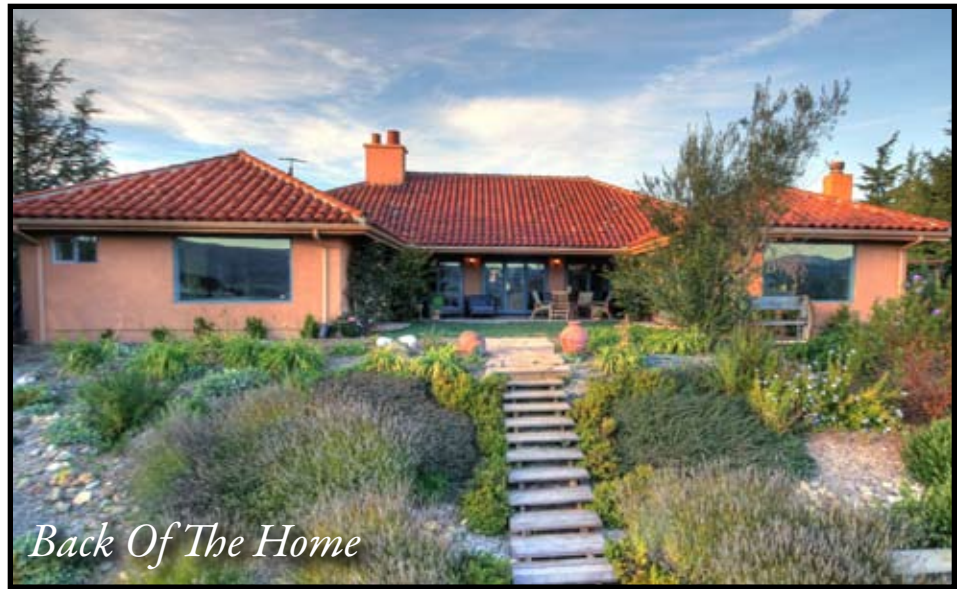
Back Of The Home