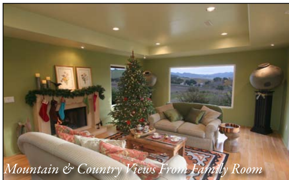
Mountain & Country Views From Family Room